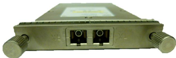
Figure 3. Cisco CFP-100G-ER4

The Cisco 100GBASE-ER4 (Figure 3) CFP module can support link lengths up to 40 kilometers on standard duplex single-mode fiber (SMF, G.652) terminated with SC/PC optical connectors. 100 Gigabit Ethernet signal is carried over four wavelengths. Multiplexing and demultiplexing of the four wavelengths are managed within the device. The Cisco 100GBASE-ER4 CFP module meets the IEEE 802.3ba requirements for 100GBASE-ER4 performance and also supports Digital Optical Monitoring (DOM) of the transmit-and-receive optical signal levels.