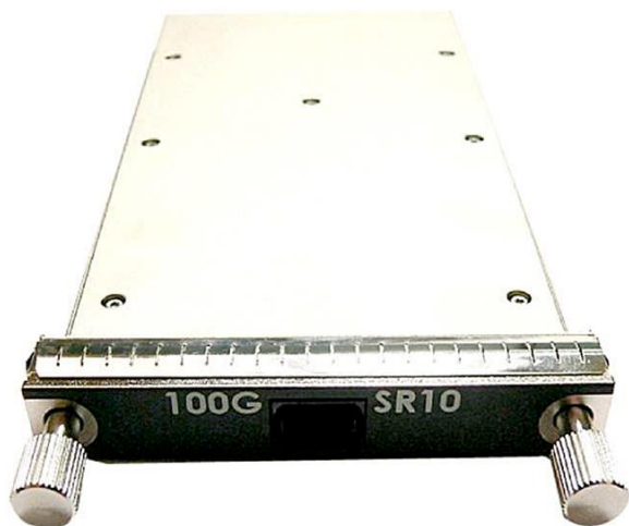
Figure 2. Cisco CFP-100G-SR10 Module

The Cisco 100GBASE-SR10 (Figure 2) CFP module supports link lengths of 100 meters and 150 meters respectively on laser-optimized OM3 and OM4 multifiber cables. It primarily enables high-bandwidth 100-gigabit links over 24-fiber ribbon cables terminated with MPO/MTP-24 connectors. It can also be used in 10 x 10 Gigabit Ethernet mode along with ribbon to duplex fiber breakout cables for connectivity to ten 10GBASE-SR optical interfaces. Maximum channel insertion loss allowed is respectively 1.9 dB over 100m of OM3 cable or 1.5 dB over 150m of OM4 cable.