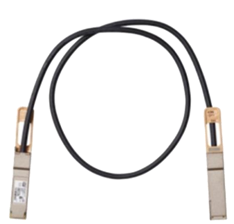
Figure 2. QSFP-100G-CU1M cables

Cisco QSFP to QSFP copper direct-attach 100GBASE-CR4 cables (Figure 3) are suitable for very short links and offer a cost-effective way to establish a 100-Gigabit link between QSFP-100G ports of Cisco switches within racks and across adjacent racks. Cisco currently offers passive copper cables in lengths of x=1, 1.5, 2, 2.5, 3 and 5 meters.