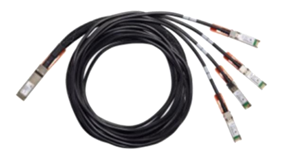
Figure 3. QSFP-4SFP25G-CUxM cables

Cisco QSFP-100G to four SFP-25G copper direct-attach breakout cables (Figure 2) are suitable for very short links and offer a cost-effective way to connect within racks and across adjacent racks. These breakout cables connect to a 100G QSFP port of a Cisco switch on one end and to four 25G SFP ports of a Cisco switch/server on the other end. Cisco currently offers passive cables in lengths of x=1, 1.5, 2, 2.5, 3 and 5 meters.