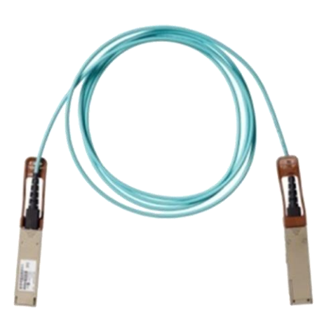
Figure 4. QSFP-100G-AOC3M cables

Cisco QSFP-100G to QSFP-100G AOC cables (Figure 4) are suitable for short distances and offer a flexible way to connect within racks and across racks. Active optical cables are much thinner and lighter than copper cables, which makes cable management easier. AOCs enable efficient system airflow, which is critical in high-density racks. Cisco currently offers active optical cables in lengths of x=1, 2, 3, 5, 7, 10, 15, 20, 25, and 30 meters.