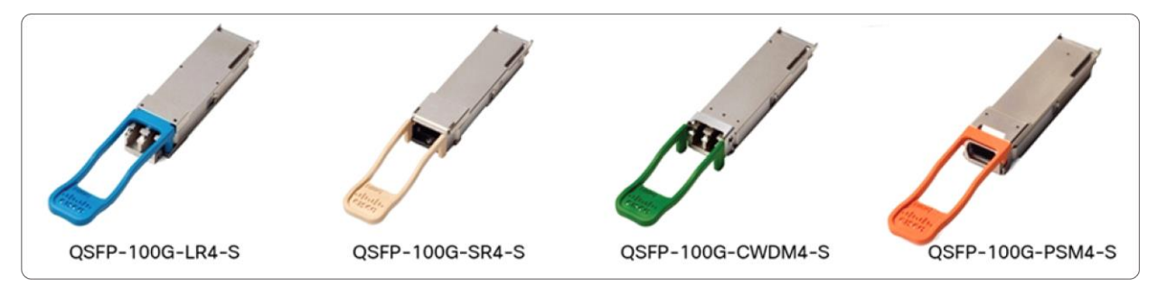
Figure 1. QSFP-100G Optical modules

The Cisco 100GBASE Quad Small Form-Factor Pluggable (QSFP) portfolio offers customers a wide variety of high-density and low-power 100 Gigabit Ethernet connectivity options for data center, high-performance computing networks, enterprise core and distribution layers, and service provider applications. The QSFP-100G modules are our latest generation of 100G transceiver modules solution based on a QSFP form factor. (See Figure 1)