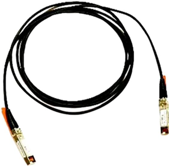
Figure 4. Cisco direct-attach twinax copper cable assembly with SFP+ connectors

Cisco SFP+ Copper Twinax (Figure 4) direct-attach cables are suitable for very short distances and offer a cost-effective way to connect within racks and across adjacent racks. Cisco offers passive Twinax cables in lengths of 1, 1.5, 2, 2.5, 3, 4 and 5 meters, and active Twinax cables in lengths of 7 and 10 meters.