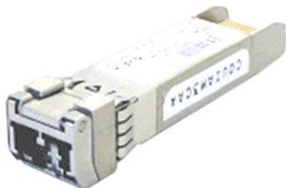
Figure 1. Cisco 10GBASE SFP+ modules

The Cisco® 10GBASE SFP+ modules (Figure 1) give you a wide variety of 10 Gigabit Ethernet connectivity options for data center, enterprise wiring closet, and service provider transport applications.