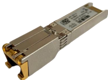
Figure 2. Cisco SFP+ 10GBASE-T module with RJ-45 connector

The Cisco 10GBASE-T module (Figure 2) offers connectivity options at the following data rates: 100M/1G/10Gbps. It has the SFP+ form factor and an RJ-45 interface so that CAT5e/CAT6A/CAT7 cables can be used to connect to end points with embedded 10GBASE-T ports. They are suitable for distances up to 30 meters and offers a cost-effective way to connect within racks and across adjacent racks.