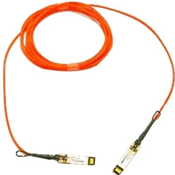
Figure 5. Cisco direct-attach active optical cables with SFP+ connectors

Cisco SFP+ Active Optical Cables (Figure 5) are direct-attach fiber assemblies with SFP+ connectors. They are suitable for very short distances and offer a cost-effective way to connect within racks and across adjacent racks. Cisco offers Active Optical Cables in lengths of 1, 2, 3, 5, 7, and 10 meters.