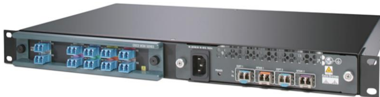
Figure 3. Cisco CWDM chassis

The transponder is compatible with the passive Cisco CWDM chassis (Figure 3) (part number CWDM-CHASSIS-2=). Two transponder devices can coexist together in the two-slot chassis. There is no limit to the number of chassis that can be stacked in a rack. Alternatively, the transponder can coexist in the same chassis with any Cisco CWDM passive filters.