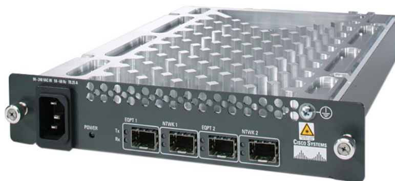
Figure 1. Cisco 2-Channel SFP WDM Transponder

In addition, when Small Form-Factor Pluggable (SFP) devices with the same wavelength reside on client and trunk sides, the unit can be simply used as a 3R regenerator (re-amplification, reshaping and retiming) for the uplink data stream (client to network path) and a 2R regenerator (re-amplification and reshaping) for the downlink data stream (network to client path), turning it into a very dynamic and flexible module.