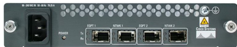
Figure 2. SFP Ports on the transponder

The transponder effectively extends the range of client devices that can connect to the CWDM or DWDM network using pluggable optics: third-party SONET/SDH add/drop multiplexers (ADMs), storage and Ethernet devices, or Cisco platforms that do not support pluggable WDM optics can connect to the WDM network by using this transponder, which operates the wavelength conversion from older 850/1300/1550 nanometer (nm) signals to any CWDM or DWDM channels. This conversion is enabled by the WDM SFP ports sitting on the line side (Figure 2).