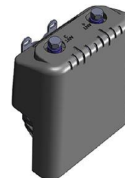
Figure 1. Cisco Aironet 1530 Series with Solar Shield/Cover

Enterprise customers are also looking to expand their wireless coverage and provide seamless network access from indoor to outdoor areas. The Cisco Aironet 1530 Series Outdoor Access Points are small enough and light enough to be unobtrusively mounted on street light poles or building facades. The integrated antenna version is just 9 x 7 x 4 inches (23 x 17 x 10 cm) and weighs 5 pounds (2.3 kg). A solar shield/cover option is also available, and can be painted to match its surroundings to allow the access point to be even less noticeable (Figure 1).