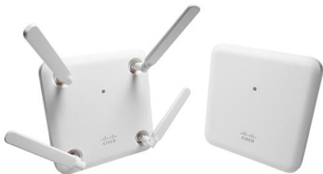
Figure 1. Cisco Aironet 1850 Series