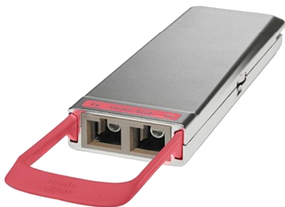
Figure 3. Cisco CPAK-100G-ER4L Module with SC connectors

These ER4 Lite modules are compatible with the 100GBASE-ER4 standard and deliver an aggregate data signal of 100 Gbps, carried over four LAN Wavelength-Division Multiplexing (WDM) wavelengths operating at a nominal 25 Gbps per lane. CPAK-100G-ER4L (no available FEC) supports link lengths up to about 25 km and CPAK-100G-ER4F supports link lengths up to about 30km with FEC disabled and 40km with FEC enabled over standard SMF, G.652. Optical multiplexing and demultiplexing of the four wavelengths are managed within the module.