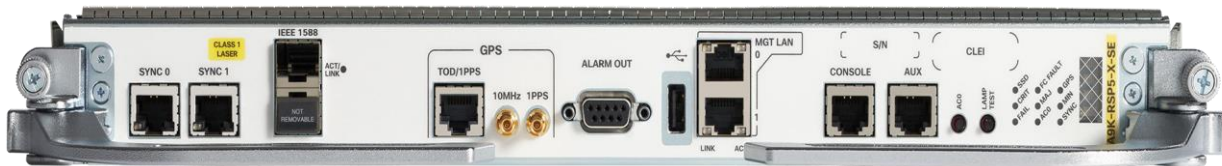
Figure 1. Cisco ASR 9000 Route Switch Processor RSP5-X - SE, Premium

The ASR 9000 Series RSP5-X brings the time-tested and robust carrier-class capabilities of Cisco IOS® XR Software to the Carrier Ethernet edge. The operating system supports true software process modularity. It also allows each process to run in separate protected memory, including each routing protocol, along with multiple instances of control, data, and management planes supported. The software also supports distributed route processing.