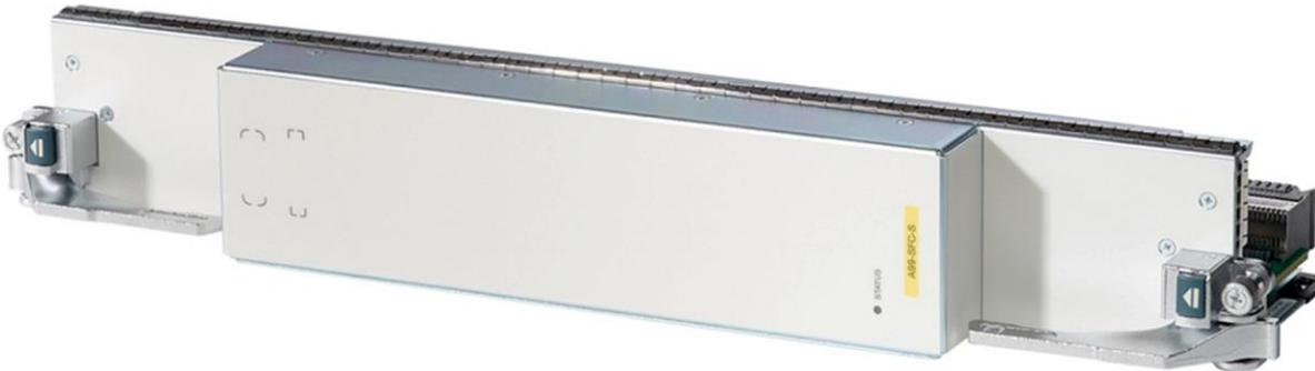
Figure 2. Cisco ASR Switch Fabric Card S