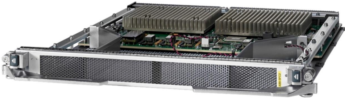
Figure 1. Cisco ASR Switch Fabric Card 2

The Cisco ASR 9900 Switch Fabric Card 2 (Figure 1), Switch Fabric Card S (Figure 2) and Switch Fabric Card T (Figure 3) are the next-generation switch fabrics for the Cisco ASR 9922 Router, ASR 9912 Router, ASR 9910 Router and ASR 9906 Router, supporting high-density 100 Gigabit Ethernet line cards. The system architecture of the Cisco ASR 9900 Switch Fabric Card 2 (ASR 9900 SFC2), Switch Fabric Card S (ASR 9900 SFC-S) and Switch Fabric Card T (ASR 9900 SFC-T) is designed to accommodate new programmable deployment models and convergence of Layer 2 and Layer 3 services, as required by today's wireline, Data-Center-Interconnect (DCI), and Radio Access Network (RAN) aggregation applications.