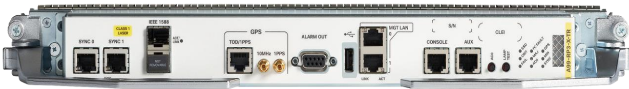
Figure 2. Cisco ASR 9900 Route Processor RP3-X - TR, Premium

The Cisco ASR 9900 RP3-X is designed to deliver the high scalability, performance, and fast convergence required for today’s and tomorrow’s demanding video, cloud, and mobile services. These features provide exceptional scale, service flexibility, and high availability: