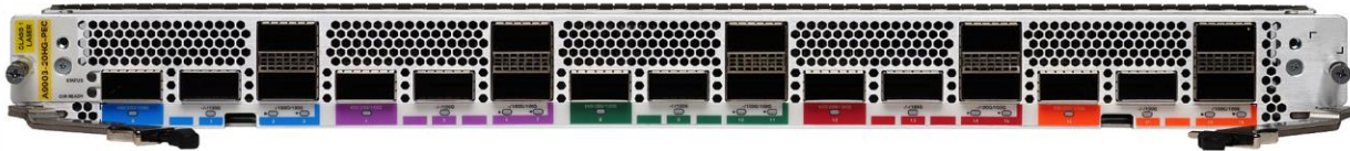
Figure 3. Cisco ASR 9903 Series 2T Port Expansion Card