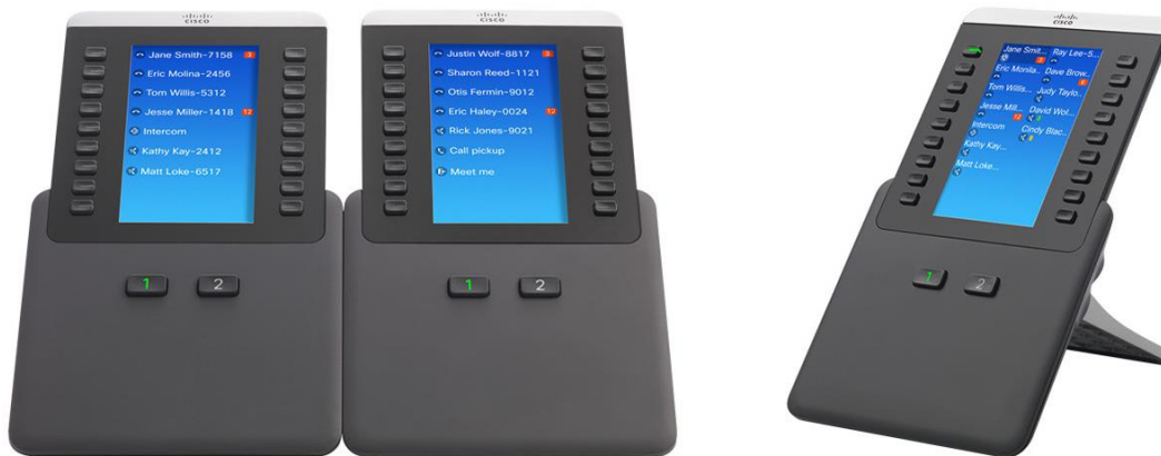
Figure 1. Cisco IP Phone 8800 Key Expansion Module

Quickly adapt to market changes. Increase productivity. Improve competitive advantage through speed and innovation. And deliver a rich-media experience across any workspace securely and with the best possible quality. Cisco® Unified Communications Solutions enable the collaboration that makes this possible (Figure 1).