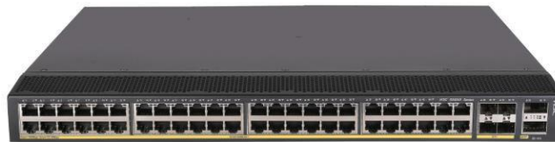
S5850-54QS switch front panel diagram

H3C S5850-54QS: Supports 48 100/1000/1000Base-T ports, 4 1GE/10GE SFP+ ports, 2 40GE QSFP+ ports