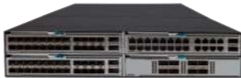
S6800-4C Front View (Module Installed)