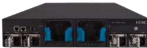
S6800-4C Rear View