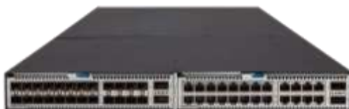
S6800-2C Front View (Module Installed)