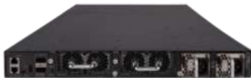
S6800-2C Rear View