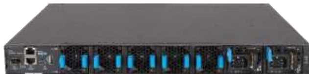
S6805-54HT Rear view