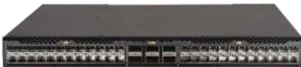
S6805-54HF Front view