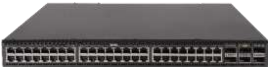
S6805-54HT Front view