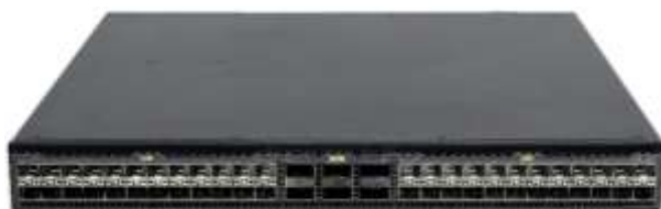
S6825-54HF front panel