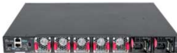
S6825-54HF rear panel