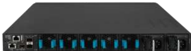
S6850-56HF rear panel