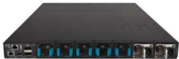
S6850-2C rear panel