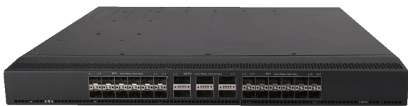
S6890-30HF front panel