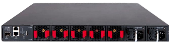
S6890-54HF front panel