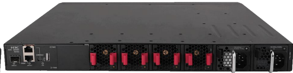
S6890-30HF rear panel