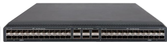
S6890-54HF rear panel